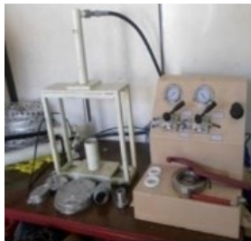
Certify and Calibrated SRV Tester