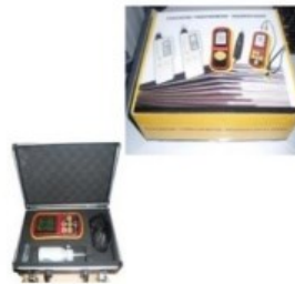
Certify and Calibrated Thickness Gauge